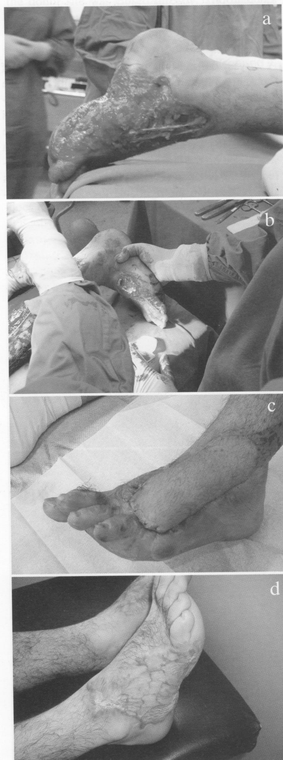
Fig. 1 1a: Skin Defect 20x10cm right lateral foot 1b: Skin defect and avulsion of the little toe left foot 1c: Coverage of the defect with split thickness skin graft 1d: Coverage of the defect with sural flap 5x5cm

and venous stasis improved. At the end of follow-